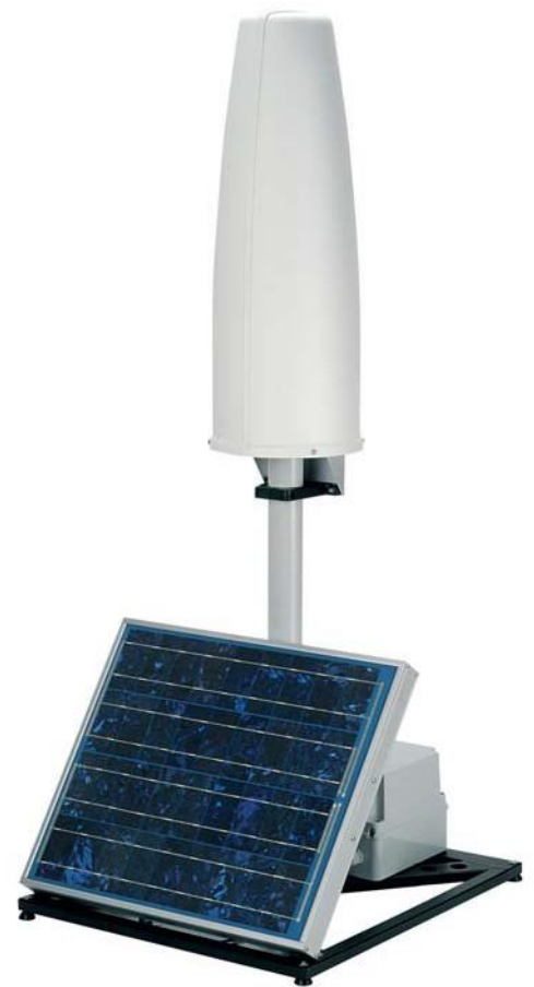
Area Monitor AMS-8061 with Solar Panel